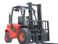
Rough Terrain Forklift