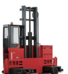
Side Loader Forklift