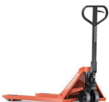
Pallet Jack Forklift